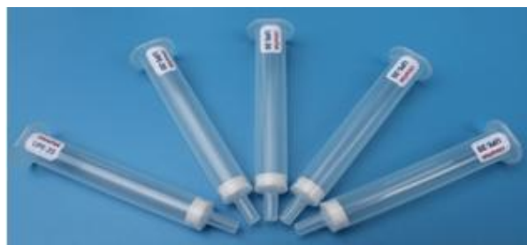
Figure(A). Typical Photo for UPE-20 cartridges

The Ultra-high Performance Extraction (UPE) cartridges are a novel type of solid phase extraction (SPE) cartridges manufactured by ChiralTek. The UPE particles were prepared through a specially-designed procedure by bonding C18 (ODS) and ChiralTek proprietary functional groups onto high-quality porous spherical silica particles. By using a ChiralTek proprietary packing approach, the UPE particles were then packed into kinds of polypropylene tubes with different sizes to manufacture several models of UPE cartridges for ultra-high performance solid phase extractions. The following Figure (A) shows a typical photo of model UPE-20 cartridges.