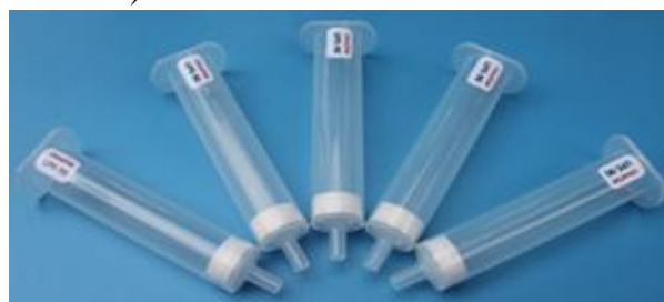
Figure(B). Typical Photo for UPE-90 cartridges

The UPE-20 model cartridges (specification: 20 mg/3mL, 120Å, 50 PCs/pkg) in Figure (A) are suitable for extraction of small volume samples (0.5 – 200mL). The sample capacity of the UPE-20 cartridges are equivalent to other supplier's 100-200mg/3mL ODS (C18) type of conventional SPE cartridges. Similarly, another model UPE-90 cartridges (specification: 90 mg/6mL, 120Å, 25 PCs/pkg) in Figure (B) are suitable for extraction of large volume samples (500 – 2000mL).